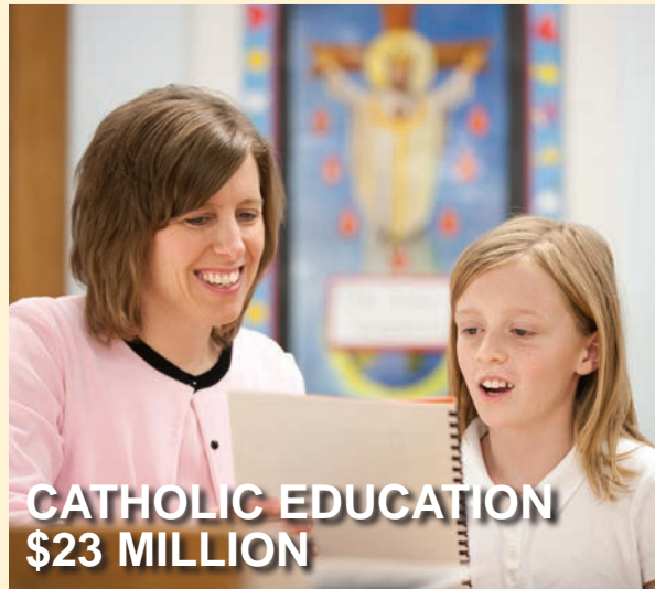
CATHOLIC EDUCATION $23 MILLION